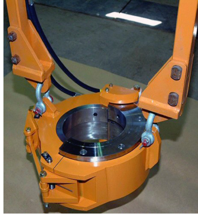
Figure 1: Fully Assembled 4-1/2" to 10-3/4" Auto SJ Elevator