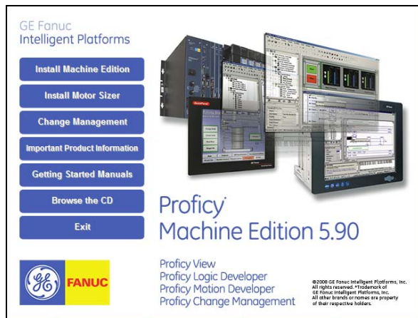
Figure 1: Proficy Machine Edition 5.9