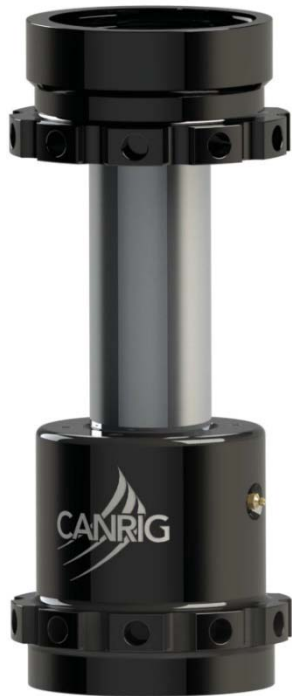
Figure 1: Canrig Washpipe Assembly