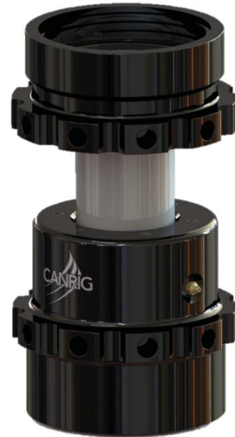
Figure 2: Tesco Washpipe Assembly